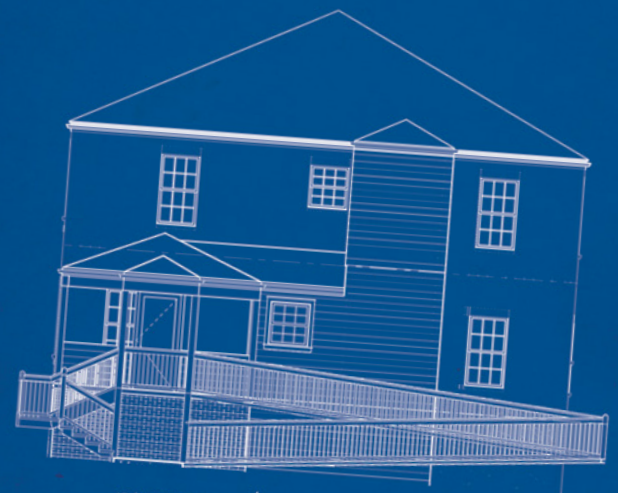
proposed rear elevation

The second house will not only serve as an accessible, supportive residence for Core Members and assistants. It will also be a thriving focal point of community life that demonstrates inclusion and belonging, an example of what life is like when people with and without disabilities can live and flourish together.