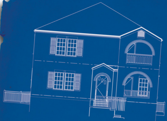
proposed front elevation

The new home will also serve as a hub for our extended community , which brings together people with and without disabilities to re-imagine what true inclusivity can be. L'Arche homes provide an environment that nurtures mutually-transforming relationships for Core Members, assistants, volunteers, and friends.